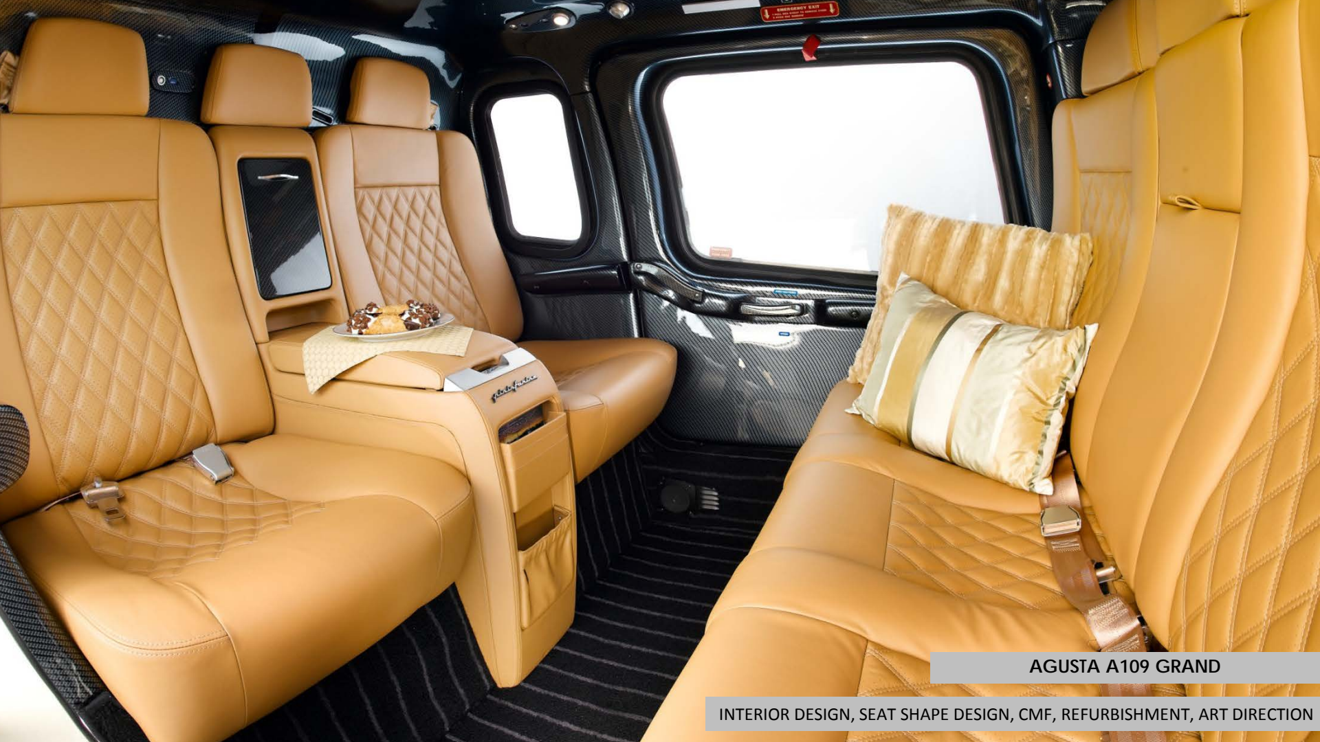
AGUSTA A109 GRAND

INTERIOR DESIGN, SEAT SHAPE DESIGN, CMF, REFURBISHMENT, ART DIRECTION